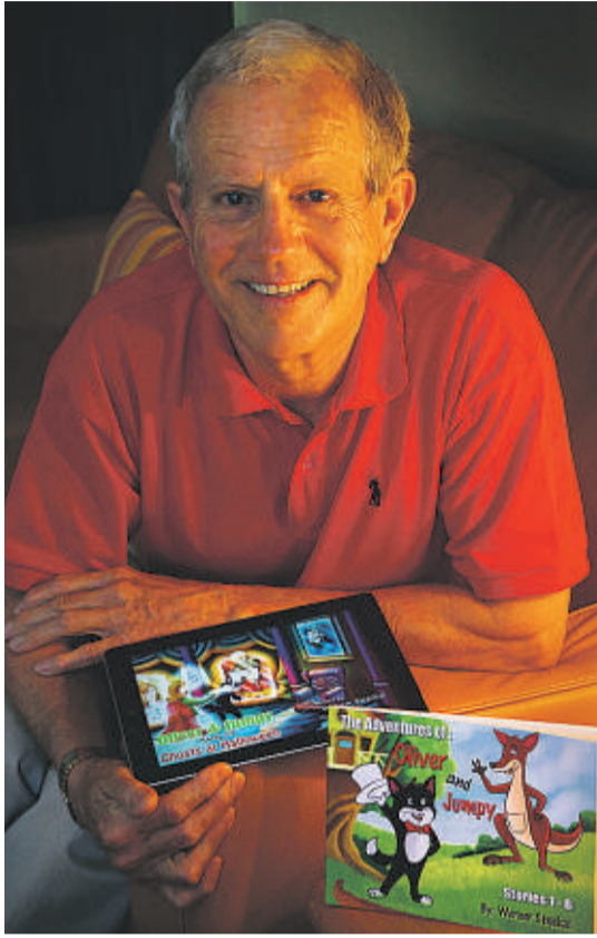
Children's author Werner Stejskal.

Stejskal has 20 books planned for the series, which features the work of five different illustra-