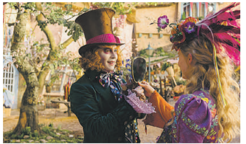
Johnny Depp and Mia Wasikowska.